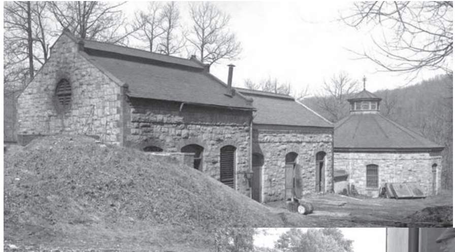
ABOVE: The Greystone Illuminating Gas plant as it appeared in the 1890s. RIGHT: At the Kings Canal Store in Ledgewood, NJ, 35 RCSIA members were weighed on the store's newly restored wagon scale. A weigh slip was issued for 4,080 pounds.

In the spring we walked the Wharton & Northern and Mt. Hope Mineral Railroads in the New Jersey Highlands. We then visited Greystone Park, the New Jersey Asylum for the Insane at Morristown, for a tour of the grounds and a visit to what may be the most complete surviving example of an illuminating gas plant in the United States. In May we traveled to the Anthracite Museum in Scranton, PA. This full-day adventure included a tour of the Lackawanna Coal Mine and a visit to Eckley Miners Village. This summer