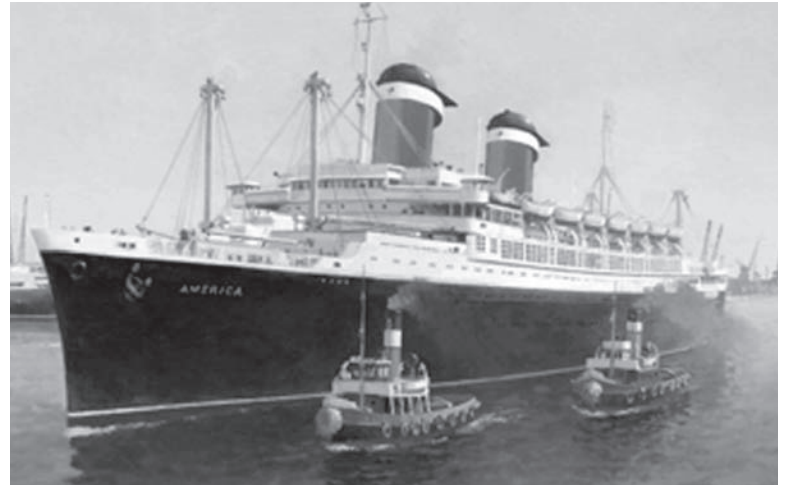
The luxury passenger liner SS United States, built in 1952 and designed to capture the trans-Atlantic speed record.

Last year's symposium was the first to be held at the Rogers Storage Building, after several years of anticipation while the building was being remodeled. The results of the LEED rehabilitation are outstanding and appreciated by all who attended. Over the past year, the venue was improved again with the installation of wall-mounted screens, a ceiling-mounted projector and a permanent sound/public address system. We are already looking forward to 2015 when we might see addi-