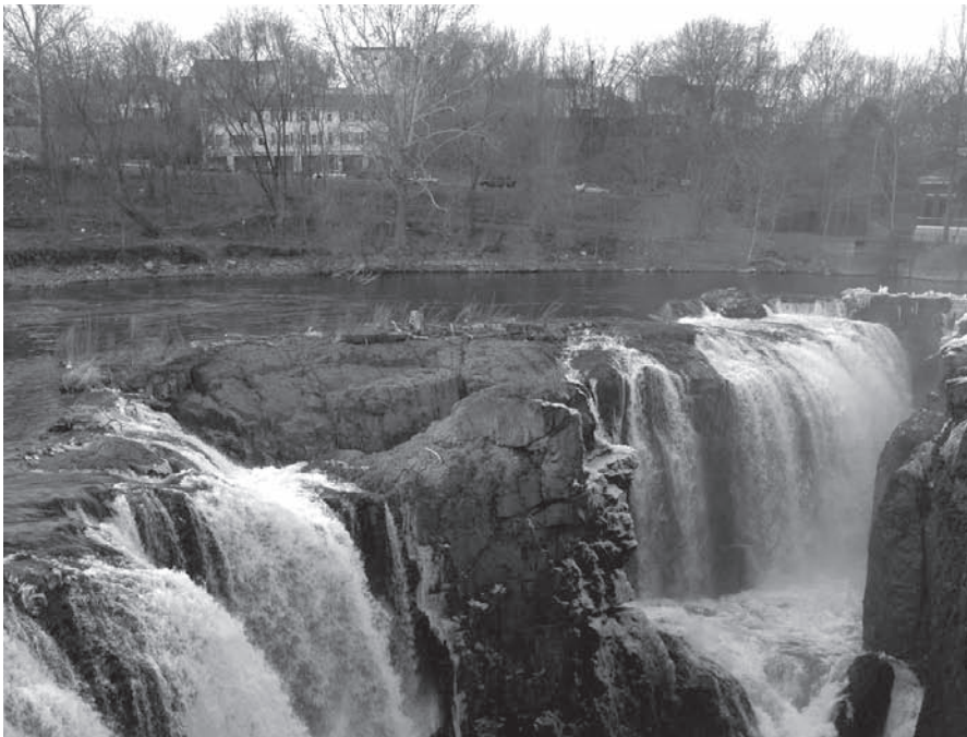
The Great Falls of the Passaic in Paterson, N.J.

Please join us on October 18 th for another round of excellent presentations on diverse topics of local as well as international interest. This year's presentations include inspirations for our region from Germany's renowned Ruhr Valley Industrial Heritage Route as well as the Derwent Valley in England, Paterson history about Silk City Diners and the Allied Textile Printing site, presentations on historic maritime and vessel preservation – the ocean liner SS United States and the whaling ship Charles W. Morgan – a rediscovery of the site where excavations for NYC's subway system began, more on the Morris Canal Greenway, as well as an update on the Great Falls National Historical Park from the Superintendent. Excerpts from two films are also featured: a rare film from the 1970s produced by the SIA called "Working Places: What Can You Do With Paterson's Old Industri-